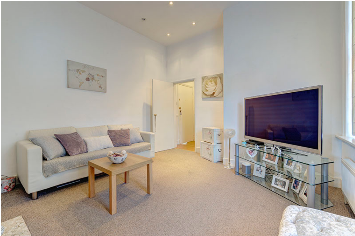
Council Tax - C £1,596 (Enfield)