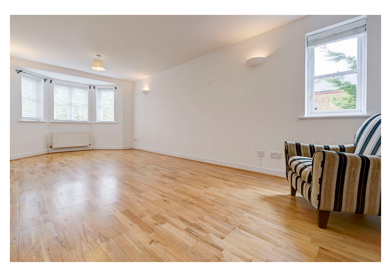
Council Tax - D £1,696 (ENFIELD)